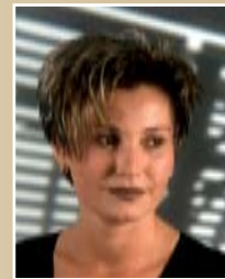
To your office